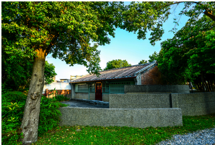
Tsunah Memorial House

This 4 day, 3 night program covers a wide range of topics, including history, culture, and civic education. The curriculum integrates academic lectures with hands-on field experiences. The main activities include: