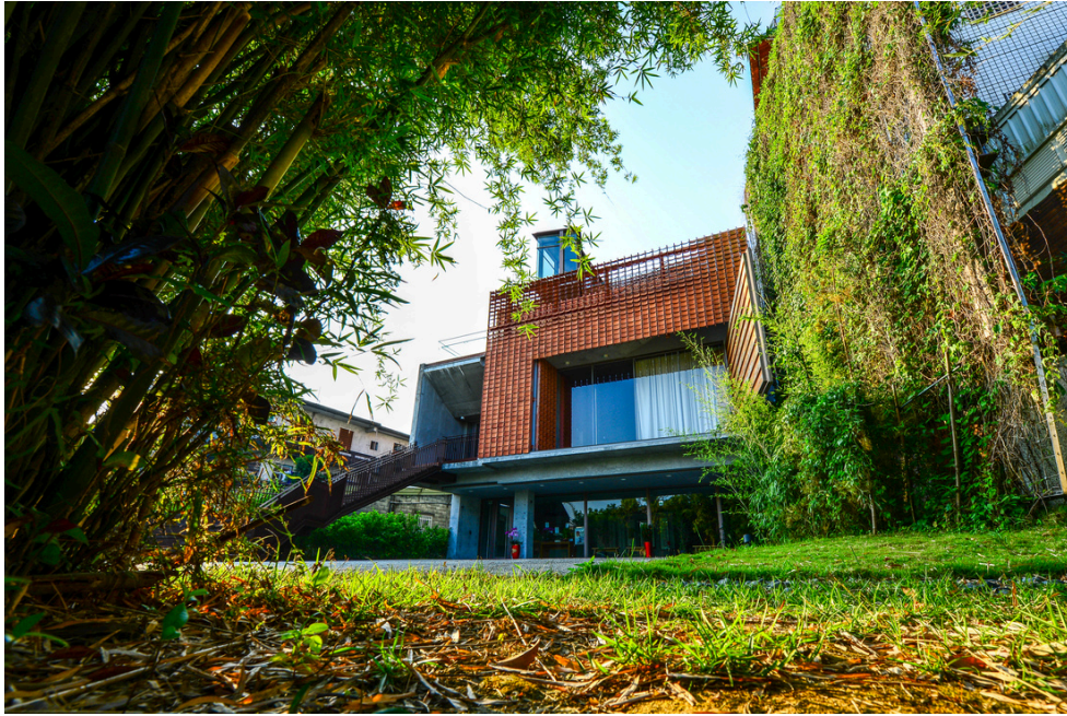
Taiwan Democratic Movement Museum