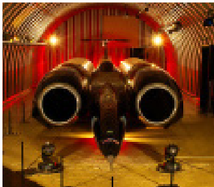
THRUST SSC, TRANSPORT MUSEUM