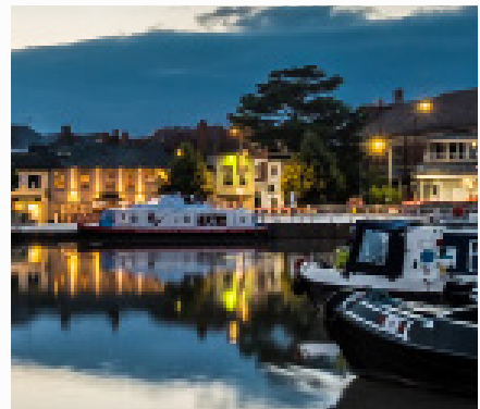
RIVER AVON, STRATFORD