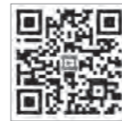
2024 Summer School Highlight Video

where summer begins, 2025 PNU SUMMER SCHOOL