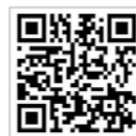
PNU Summer School